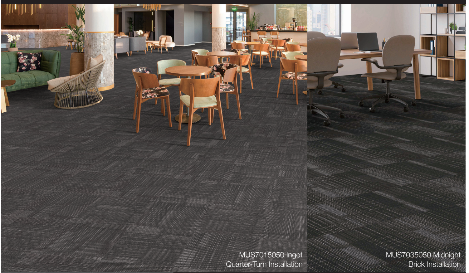
MUS7015050 Ingot Quarter-Turn Installation