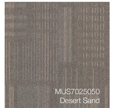
MUS7025050 Desert Sand