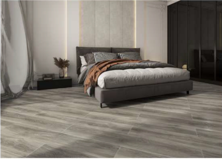
DLV704 - Gershwin Grey