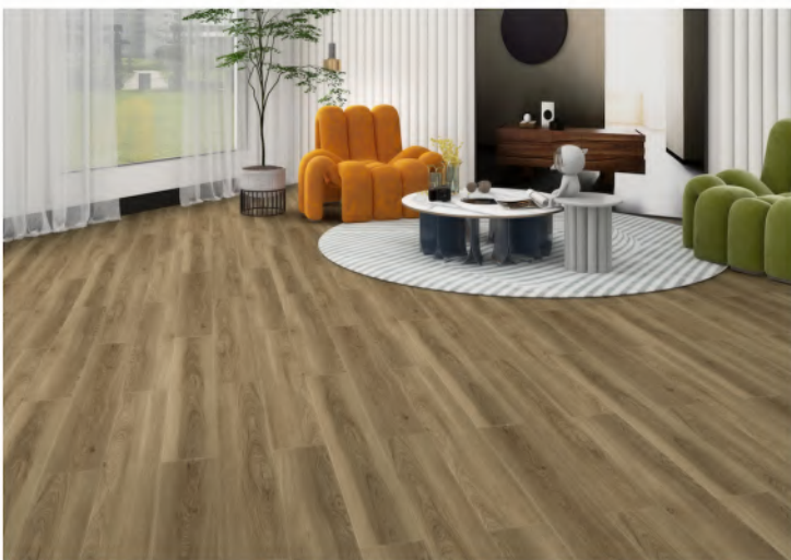
DLV703 - Bach Brown

*EVP crossover sku = DEV702 - Ludwig Beige