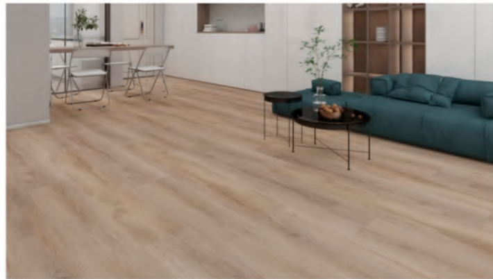
DLV909- Grande Grey

*EVP crossover sku = DEV708 - Morrison Mocha