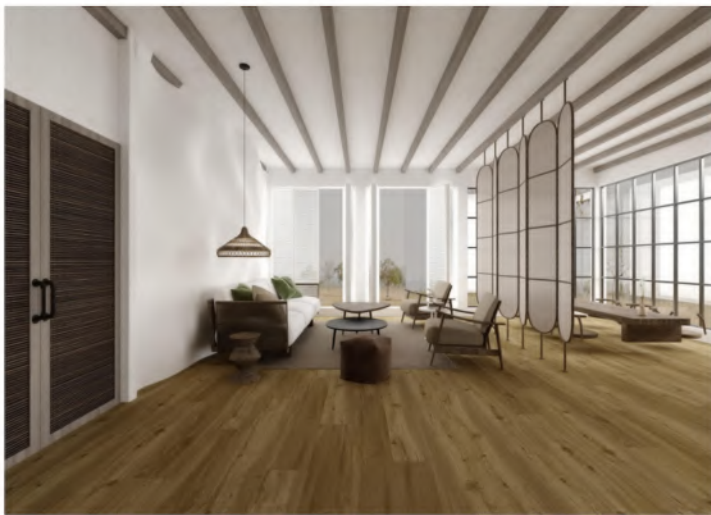
DLV702 - Beethoven Beige

*EVP crossover sku = DEV701 - Iron Rod Wolfgang