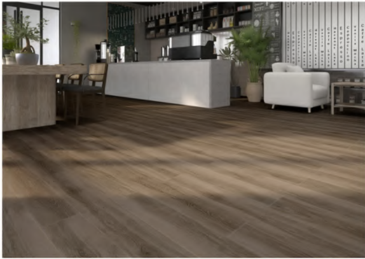
DLV701 - Midnight Mozart