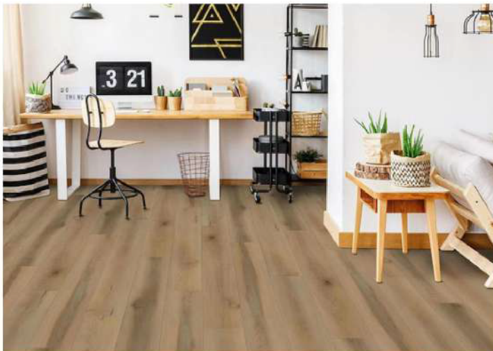
DLV706 - Chopin Hickory

*EVP crossover sku = DEV705 - William Desert