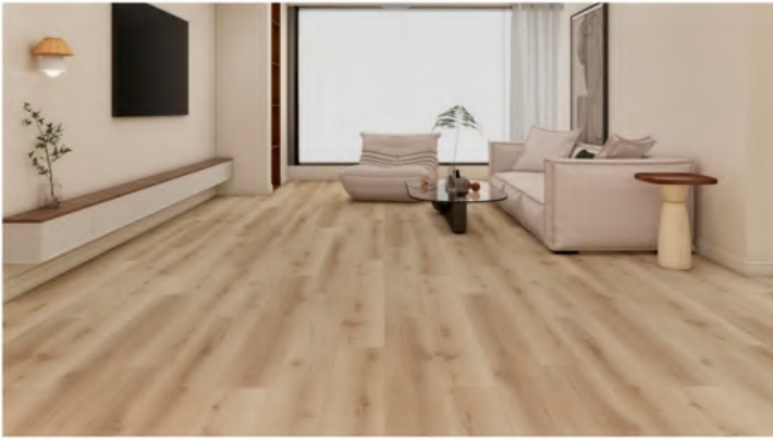
DLV707 - Mercury Mist