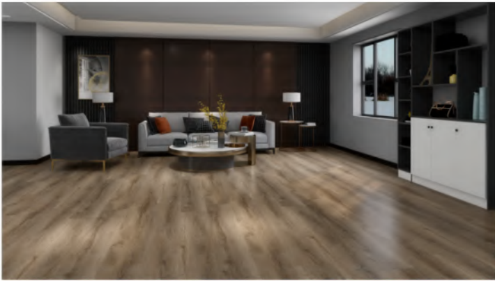
DLV908 - McCartney Mocha

*EVP crossover sku = DEV707 - Mayfield Mist