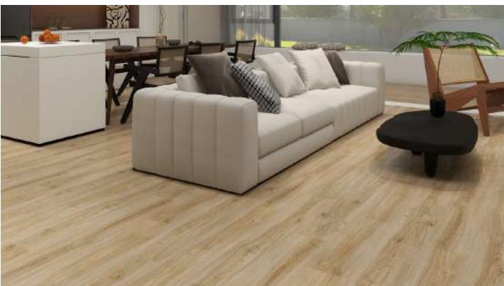
CASDLV910 - Sinatra Sand