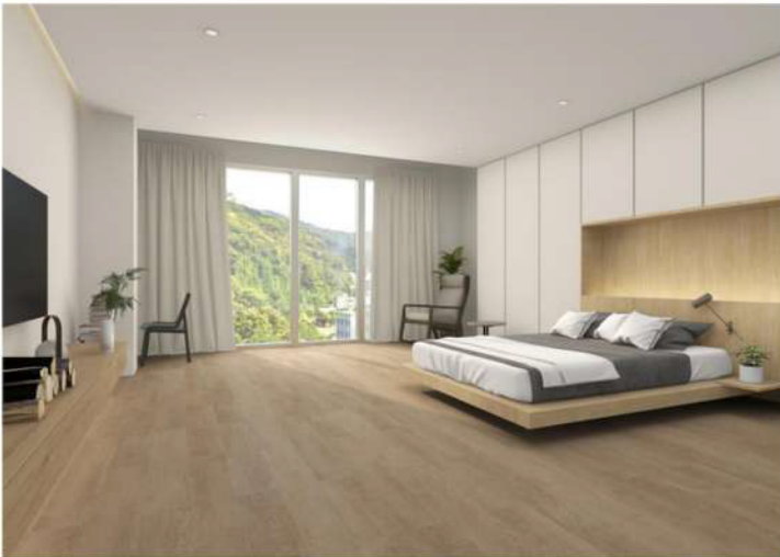
DLV705 - Coastal Bryd

*EVP crossover sku = DEV704 - George Grey